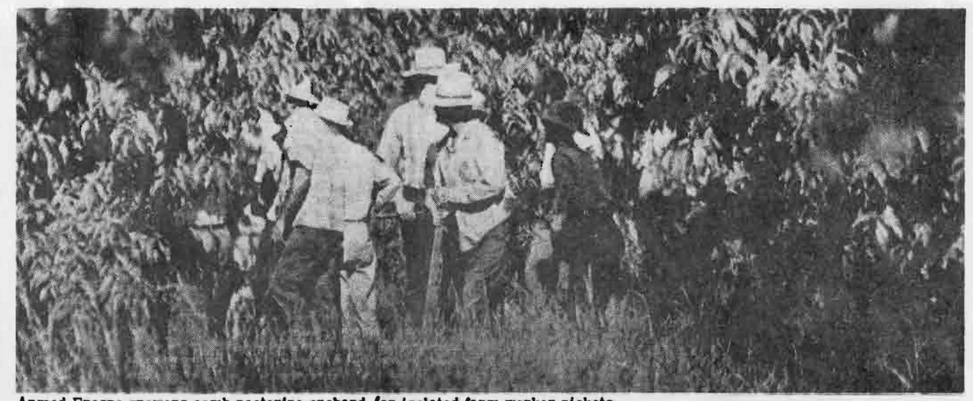
Armed Fresno growers comb necterine orchard for isolated farm worker pickets,

AS WE WERE ARRESTED FOR PEACEFUL PICKETING, GROUPS OF ARMED GROWERS AND VIGILANTES PROWLED RURAL CALIFORNIA. TRAGEDY WAS INEVETABLE.