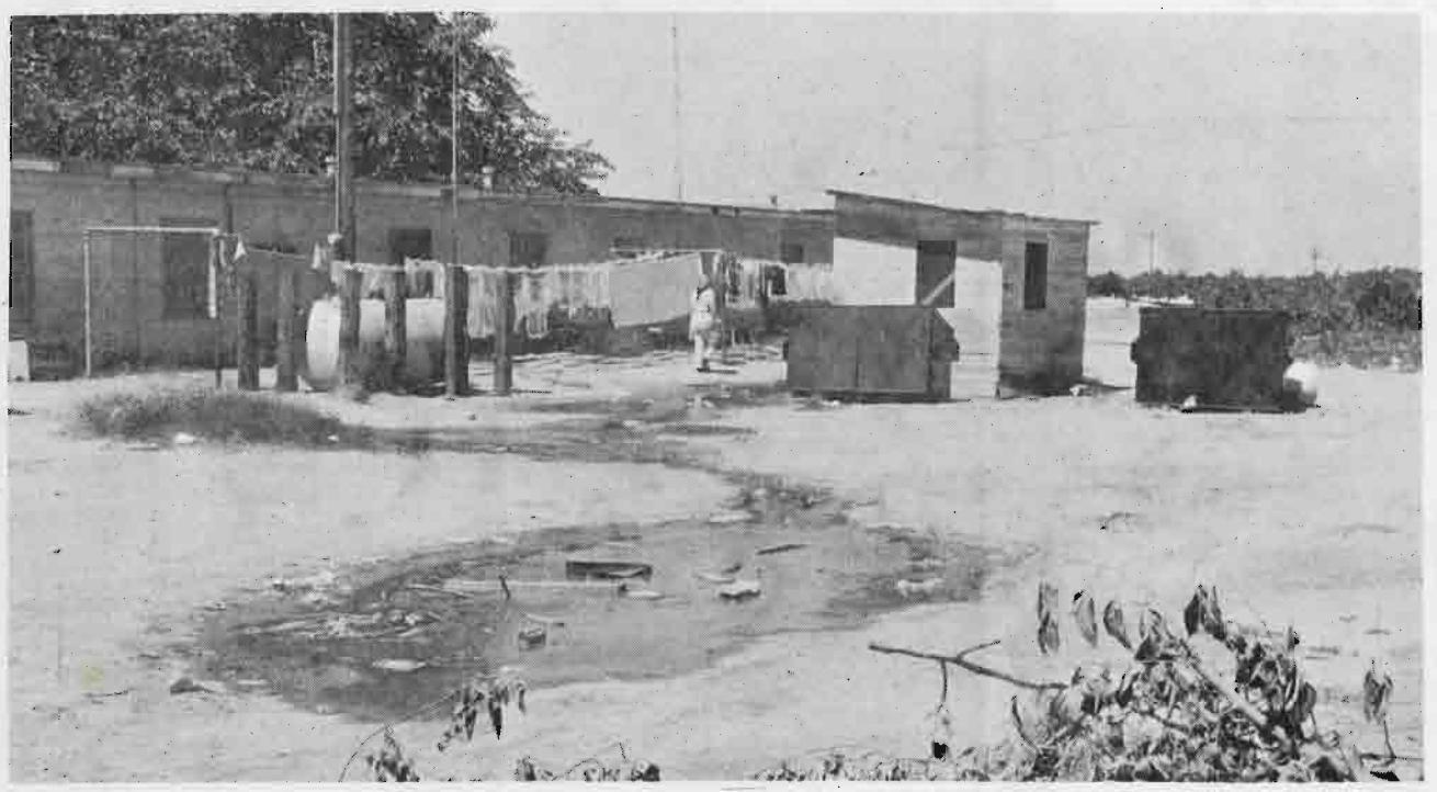
E. and J. Gallo Camp number one.